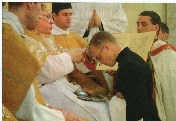
Center right: During the Ceremony of First Tonsure the Bishop snips the hair of each tonsurandi from 5 places in the shape of the cross.