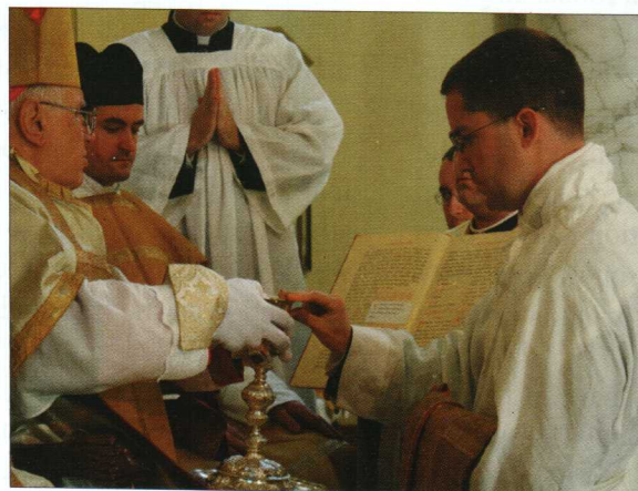
Bottom right: The seminarians to receive the Minor Orders form a semi-circle before Archbishop Cordileone in the sanctuary, first the porters and lectors, then the exorcists and acolytes.